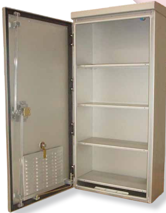
Caltrans version shown