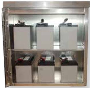
General purpose 27" x 24" x 8" version shown with optional batteries