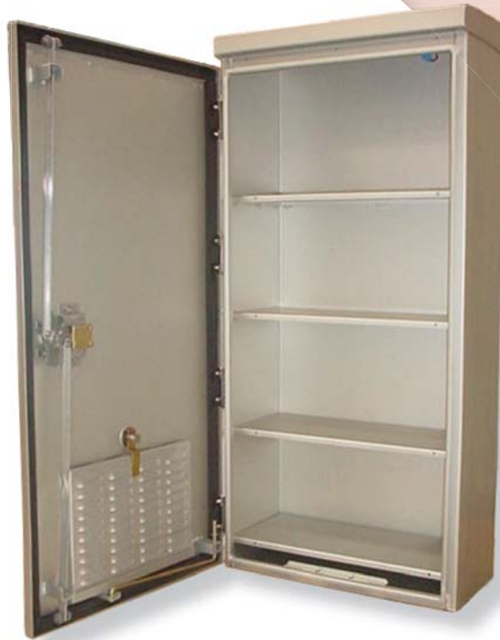
Caltrans version shown