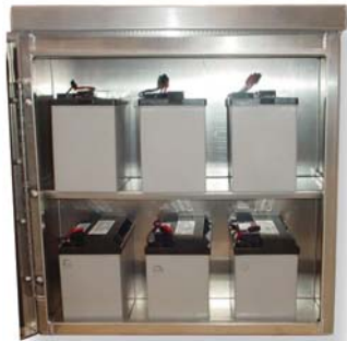
General purpose 27" x 24" x 8" version shown with optional batteries